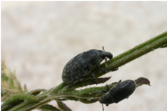
Larinus minutus

So, the battle continues, but in all honesty, I find long term bio-control programs to be a little on the dull side. All this nibbling and gnawing is fine, but it's far from entertaining. I want a bio-control that attacks at dawn and has everything chewed to shreds before lunch. That's right. A six-hundred pound bio-control with teeth the size of pruning shears that devours weeds, seeds, stems, roots and all and then poops in a bucket! Now that's entertainment!