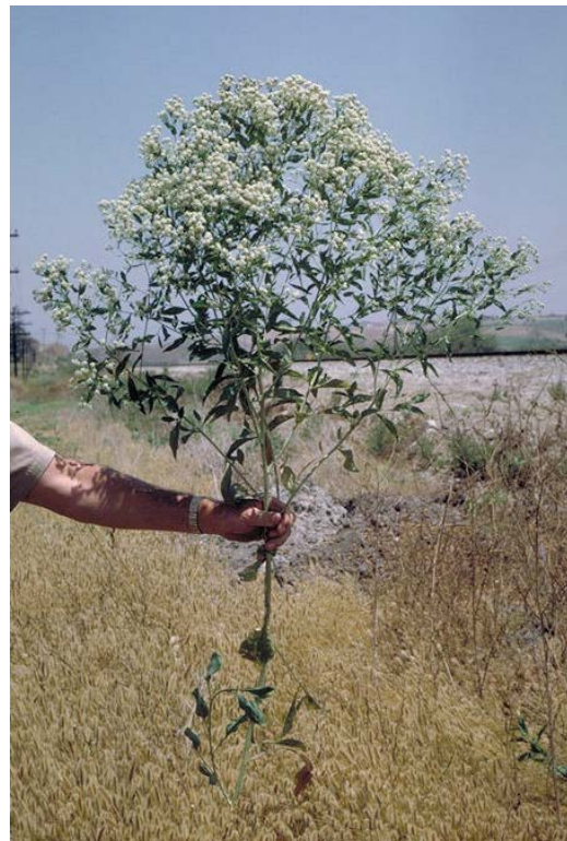
Perennial Pepperweed

About the same time that the perennial pepperweed was doing its thing another weed that had garnered little enthusiasm made its presence felt in many areas of the Western United States. Houndstongue ( Cynoglossum officinale ) is a poisonous biennial of the Borage family with Velcro-like seeds that are nuisance to humans and animals alike. For many years houndstongue was simply considered to be an annoyance, but by the year 2000 it began to demonstrate its voracious appetite for good rangeland. What made the matter even more disconcerting was that houndstongue occupied a completely different geographic niche than the perennial pepperweed. Today, in Crook County, houndstongue infests hundreds of acres of public and private land. Once again, we didn't see it coming.