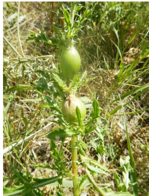
“ Urophora carduii ”